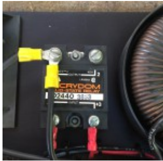
Figure 3: Strapped dimmer sending direct power.

Solutions that can be done in-house include bypassing the electronics within a dimmer module and wiring straight to the circuit breaker. This might be particularly advantageous for those theatres that have dimmer modules that are nonfunctional and/or in need of repair. (Again, if you are not appropriately trained and authorized to do this: Don't! Consult a professional.)