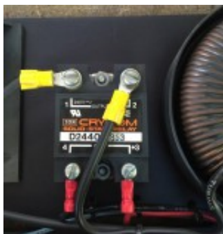
Figure 4: The restored dimmer.

A third option is to bypass the power to the lighting grid completely, and simply plug in fixtures to a standard building outlet in the wall. Depending on how your theatre was built, and where your grid was placed, there may be power outlets close enough to the grid for you to take advantage of.